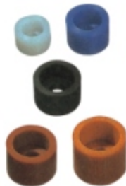
TYPE: JFA59 & JFA60 (Counterbore hole free type)