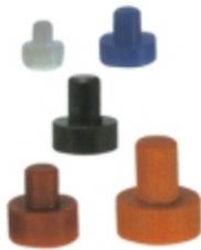
TYPE: JFA57 & JFA58 (Nosefree type)